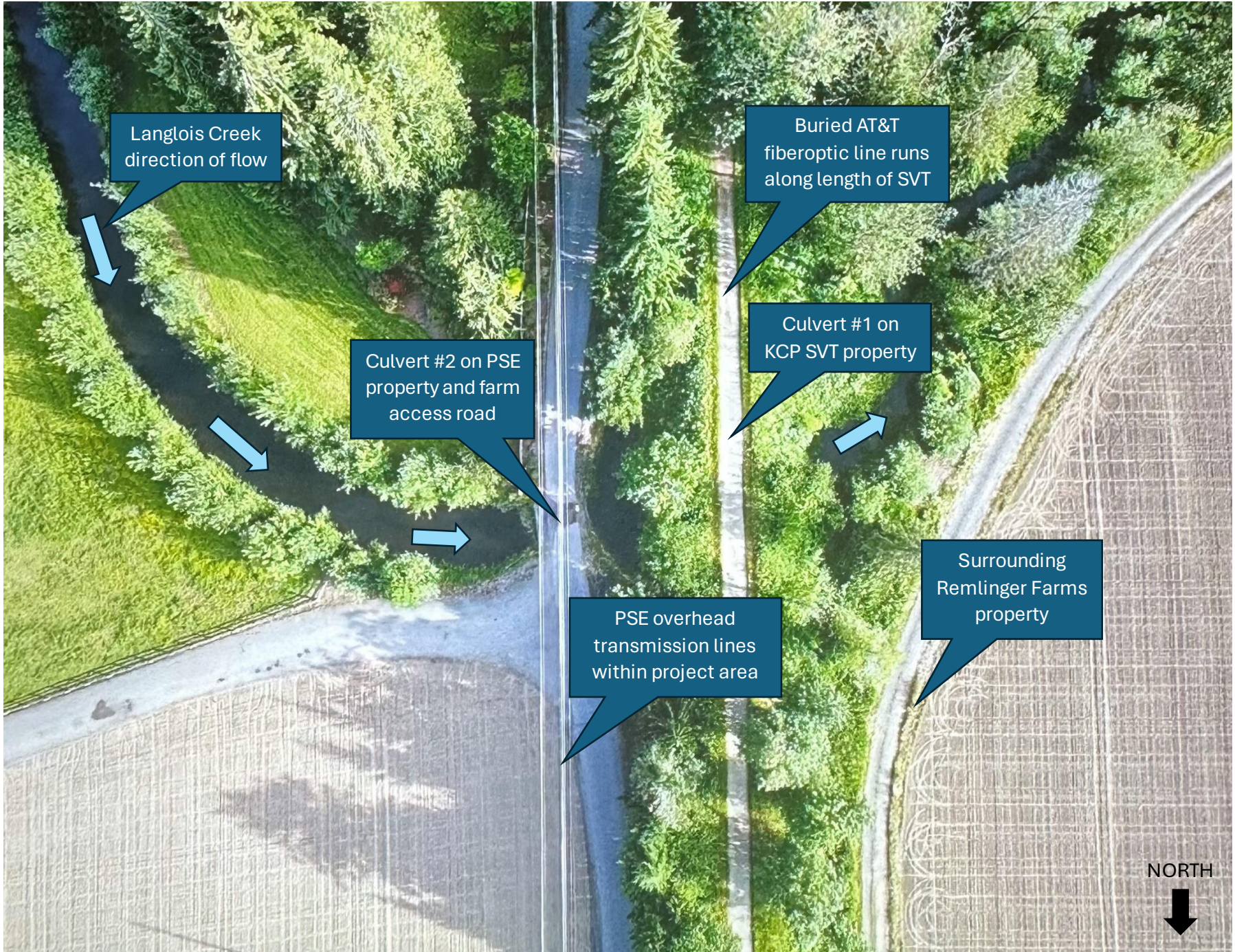
Figure 1. Project Area Overview