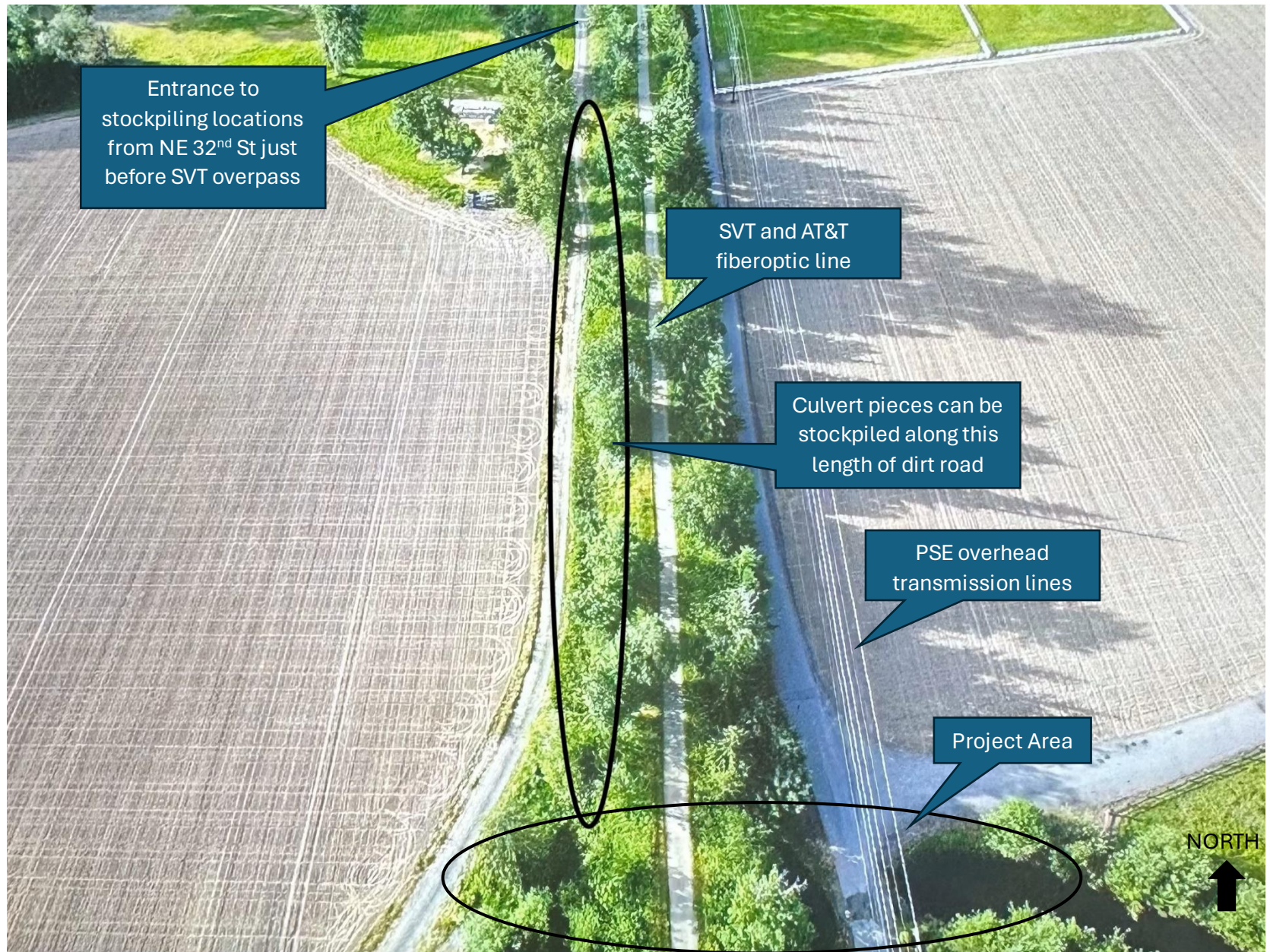
Figure 4. N Facing View of Stockpiling Location